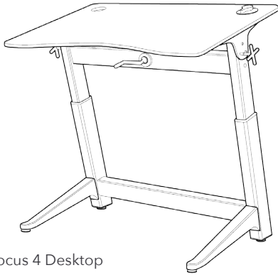
Locus 4 Desktop